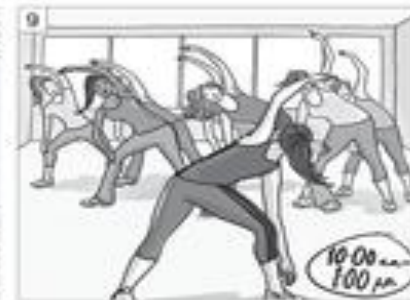
9. She works from 10am to 13pm.