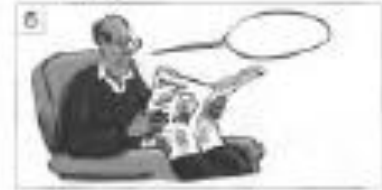
6 I _____ glasses.