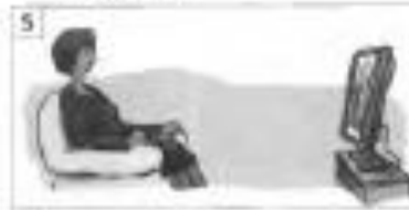
5 She _____ TV in the evening.