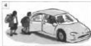
4 They _____ to school by car.