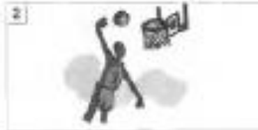
2 He _____ basketball.