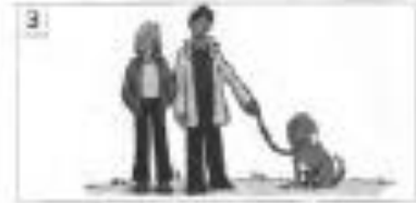
3 They _____ a dog.