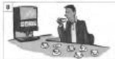
8 He _____ a lot of coffee.