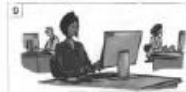
9 She _____ in an office.