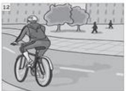
12. She comes back home.