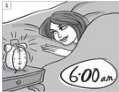
1 She wakes up at 6.00.