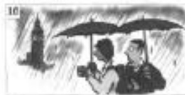
10 It _____ a lot here.

b Write negative - sentences for pictures 1-10.