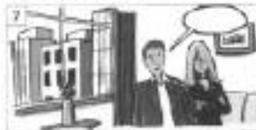
7 We _____ in the city centre.