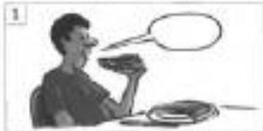
1 I like pizza.

a Write a positive + sentence for each picture with different verbs.